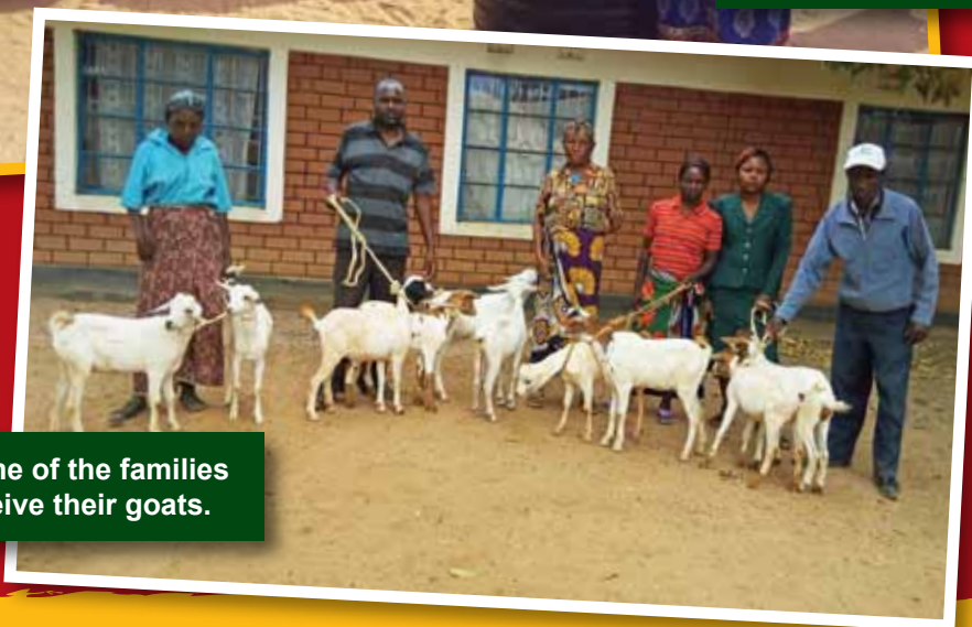
Some of the families receive their goats.

As well as helping these 40 families to find a sustainable way out of poverty, the project is also changing negative attitudes towards disabled people in the community.